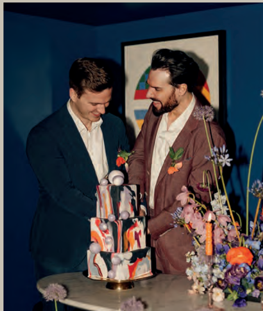
ALL OUT BASH