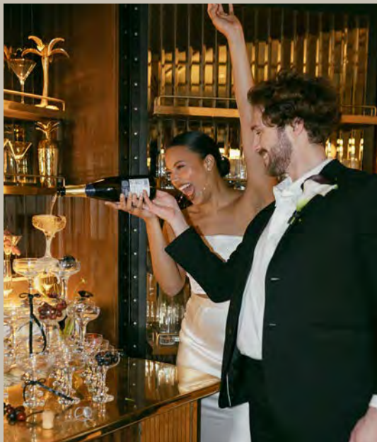
BUBBLES & NIBBLES

From elegant delicacies to comforting crowd-pleasers, our executive chef will tailor the menu to suit your every wish and desire.