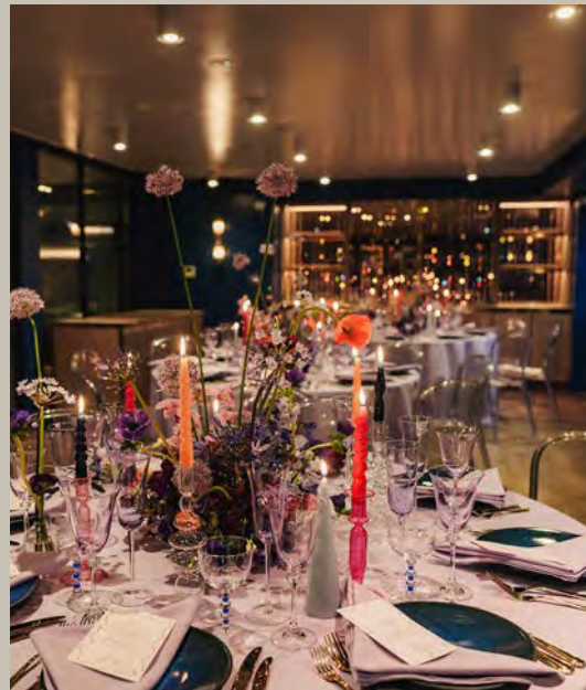
THE BLUE ROOM