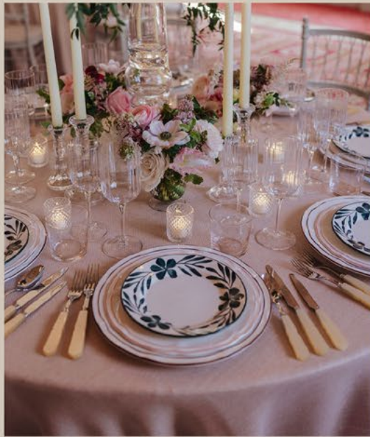
PACKAGE I TIMELESS ROMANCE

Our Executive Chef will work closely with you to craft your perfect menu, drawing on the finest seasonal ingredients to create dishes that feel both considered and personal. Pair it with one of our carefully curated drinks packages and toast to the wedding of your dreams.