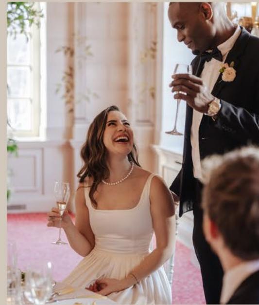
PACKAGE II HAPPILY EVER AFTER