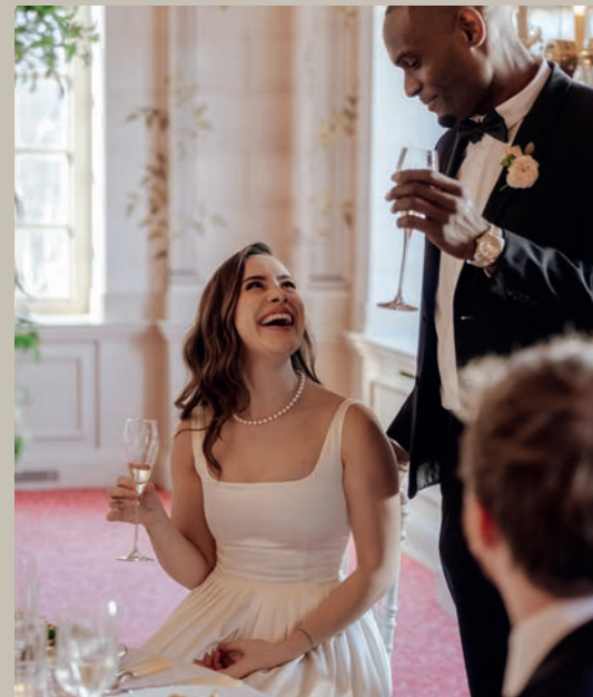
HAPPILY EVER AFTER