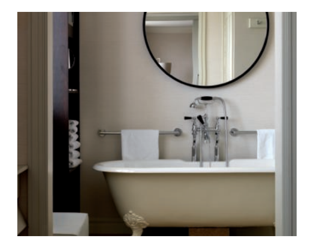
TOTAL ROOMS: 205 Superior 154 (42 rooms front-facing) Deluxe 24 Suites 27 (Studio 9, Luxury Studio 10, Luxury King 5, Luxury Four Poster 2 Presidential 1)