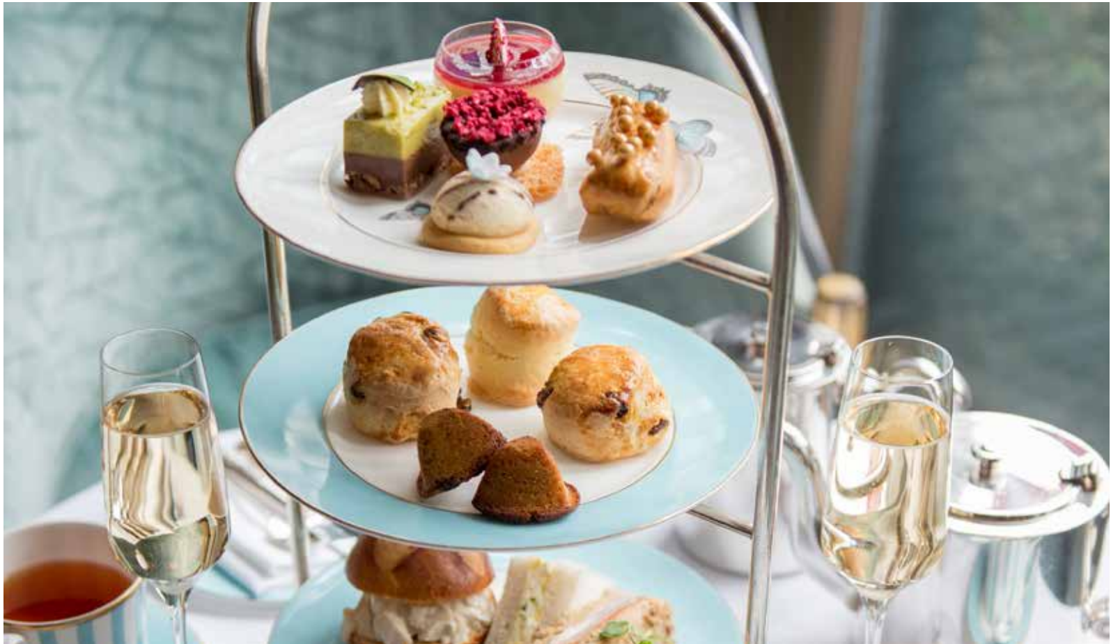
The Gallery, the hotel's design showpiece and home to one of Ireland's foremost privately-owned art collections, is a beautiful and unique setting in which to linger over The Westbury's iconic Afternoon Tea.