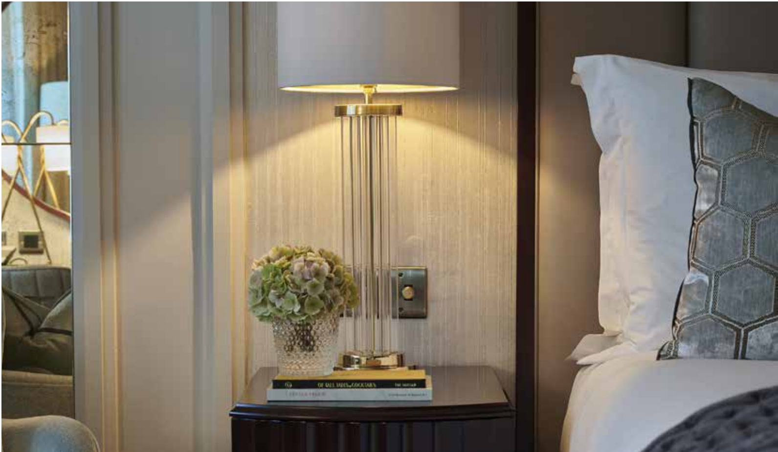
The epitome of understated luxury, guest rooms and suites at The Westbury provide spacious accommodation with thoughtful contemporary design, showcasing the best of Irish and international design combined with the latest technology.