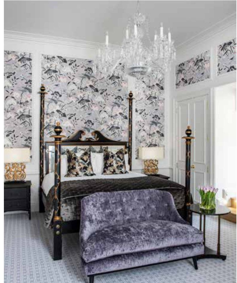
An exquisite blend of period charm and modern comfort, The Kensington's 24 suites reflect the epitome of refined luxury set within the timeless glamour of London's leafy museum district.