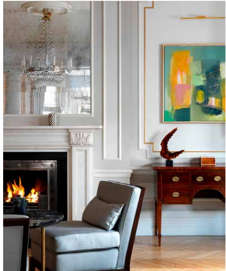
The natural charm of the hotel's Drawing Rooms provides the ultimate backdrop for Afternoon Tea while Townhouse provides a stylish setting for lunch and dinner.