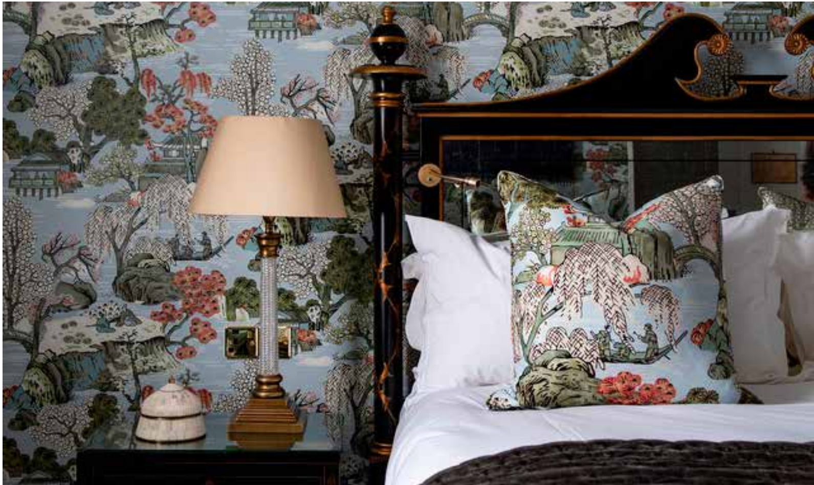
Historic charm meets sleek contemporary style in The Kensington's 126 guest rooms. Complementing this historic building's classic Victorian townhouse architecture, each room is decorated in a light and elegant style using brightly coloured wallpapers and fabrics in bold floral and toile patterns.